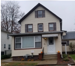
Coffey Residence Red Bank

Our congregate living homes have been the cornerstone of our mission since HABcore's inception in 1988.